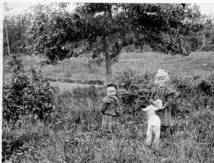
Wisconsin Historical Society

A few hundred fine fleeces of wool, sold at the price which it will command, if our tariff is not repealed, would return into the pockets of the producer a sum of money which it would take a long time and much hard labor to bring from the products of the soil.