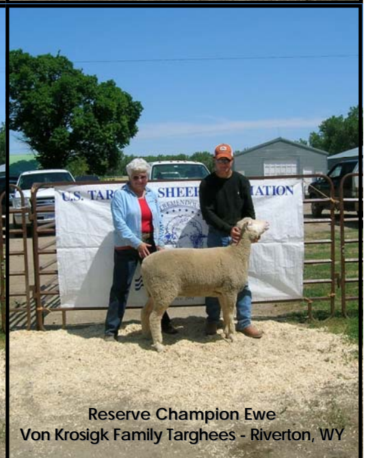
Reserve Champion Ewe Von Krosigk Family Targhees - Riverton, WY