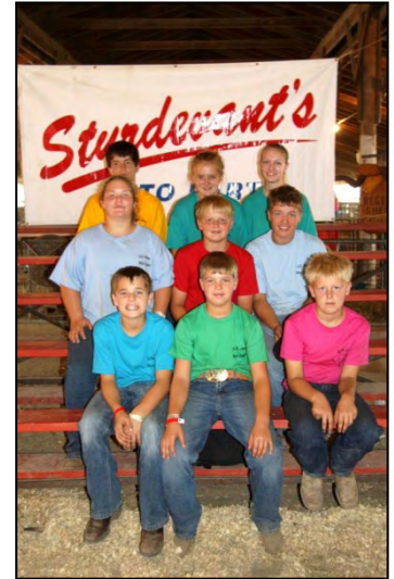
SD youth showing Targhees