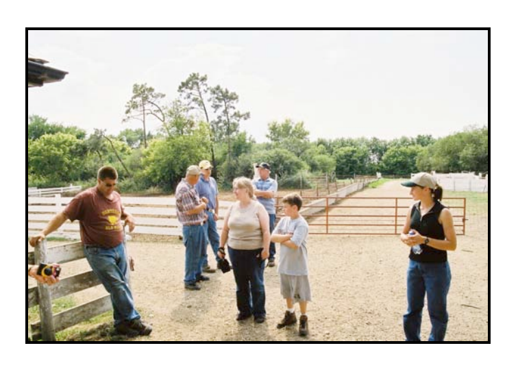
South Dakota State University Sheep Unit Tour