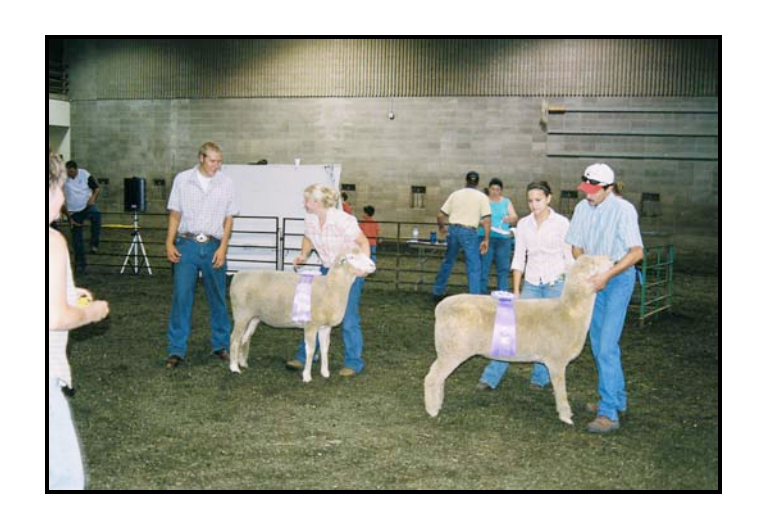
2006 Champion & Reserve Champion Ewes – University of Wisconsin Madison