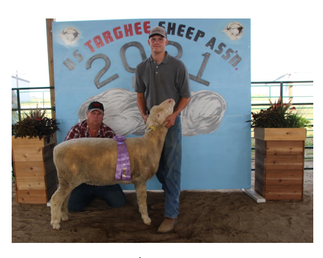
Reserve Champion Ewe Beastrom Family