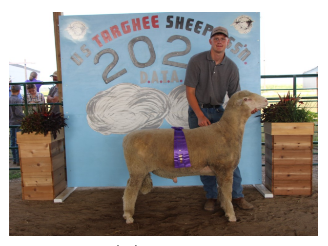
Grand Champion Ram Beastrom Family