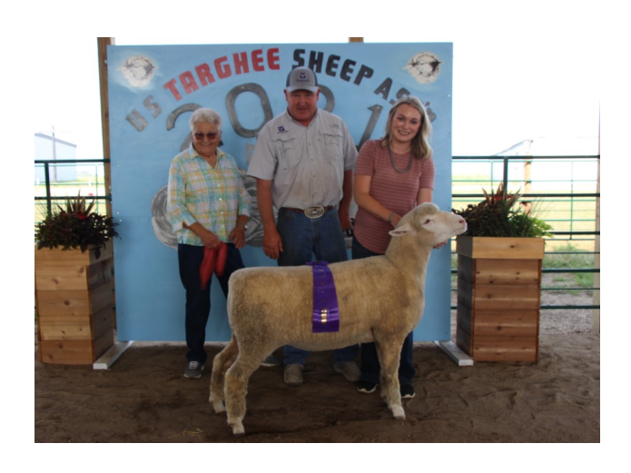
Grand Champion Ewe Von Krosigk Family Targhees