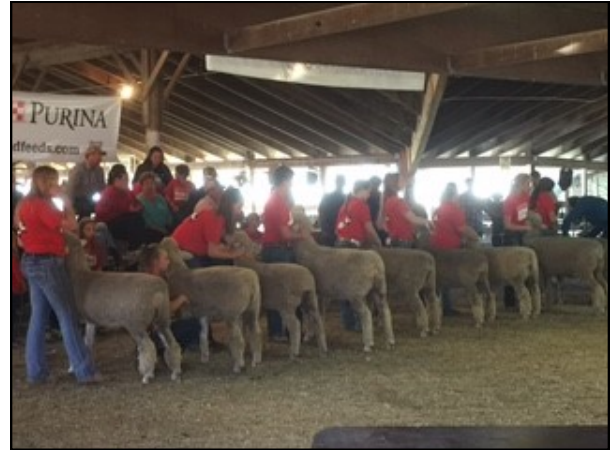
Huron Wool Classic